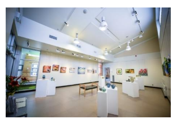
Cedar Hill Main Gallery

The gallery space is approximately 68 square meters (730 square feet) and approximately 31' long x 21' wide. The hanging system is 24.3m (80 feet) and holds 40 adjustable hanging cables and 60 hooks. Gallery lighting features a fixed spot lighting system with west facing skylights.